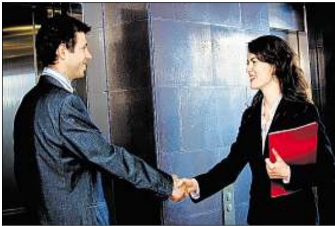
DIVERSITY: Leicestershire has a lot to offer.

Leicestershire as a county has a lot to offer the business visitor and boasts all the benefits of city life combined with beautiful countryside.