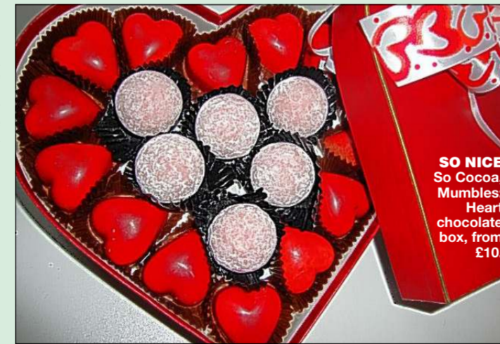
SO NICE So Cocoa, Mumbles: Heart chocolate box, from £10.

Wine and Dine for £10. There were 20 or so different products to choose from. We decided on the Taste the Difference Seabass fillets with roasted fennel and orange butter followed by a mixed berry Panna Cotta for dessert, all served with a First Cape sparkling Pinot Grigio.