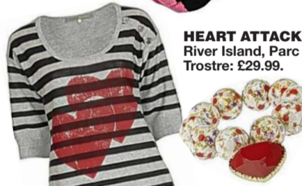
HEART ATTACK River Island, Parc Trostre: £29.99.