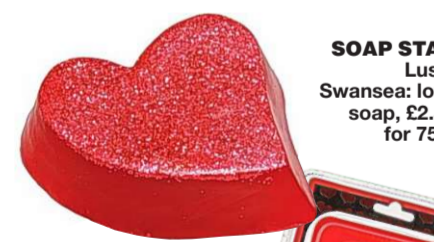
SOAP STAR Lush, Swansea: love soap, £2.50 for 75g.