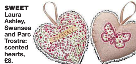
SWEET Laura Ashley, Swansea and Parc Trostre: scented hearts, £8.