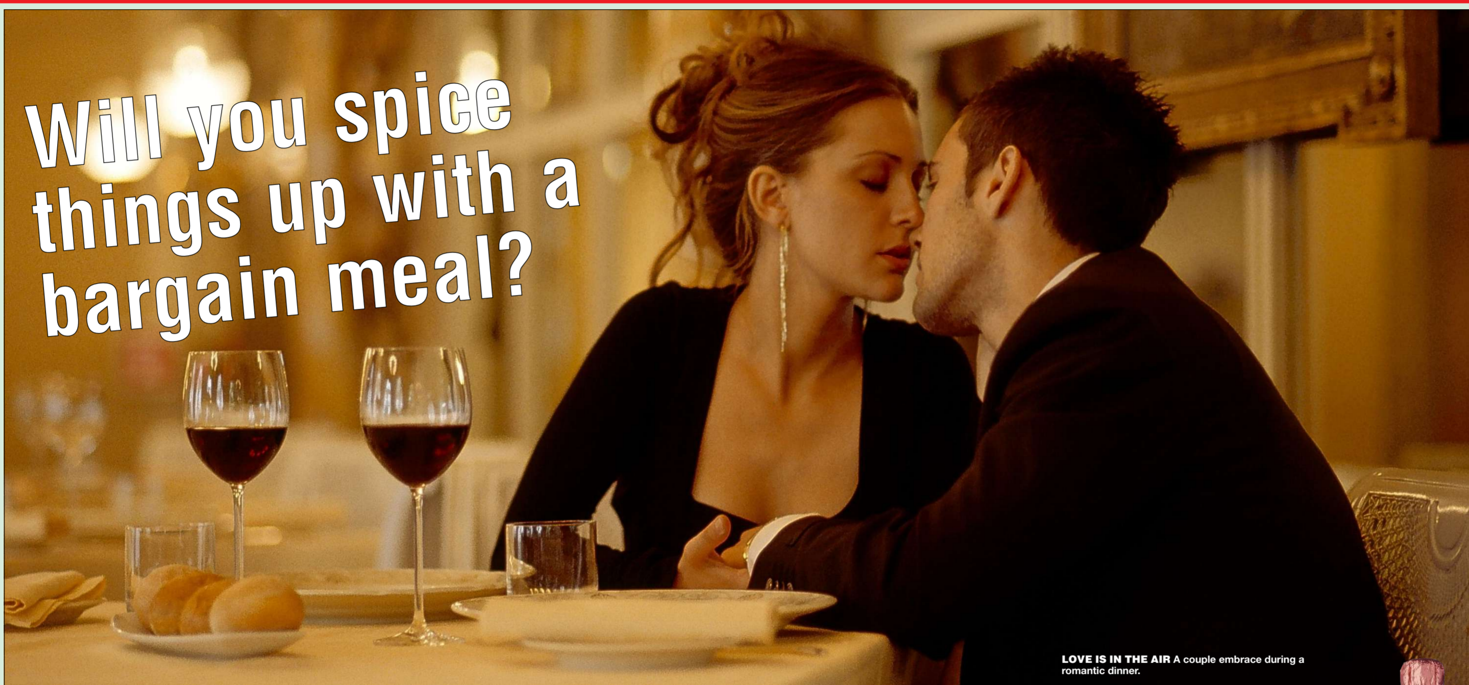
LOVE IS IN THE AIR A couple embrace during a romantic dinner.