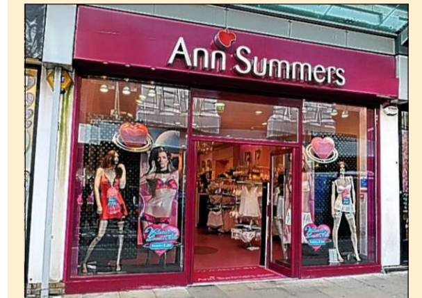
THINK PINK Ann Summers store, Whitewalls, Swansea. GM050210H_001