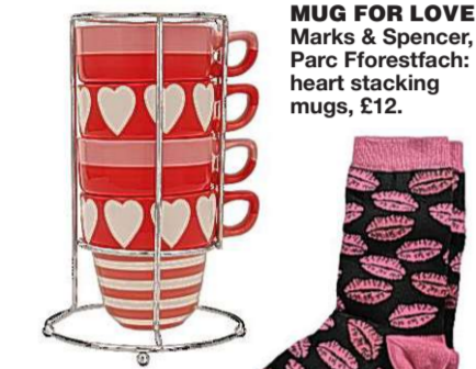
MUG FOR LOVE Marks & Spencer, Parc Florestfach: heart stacking mugs, £12.