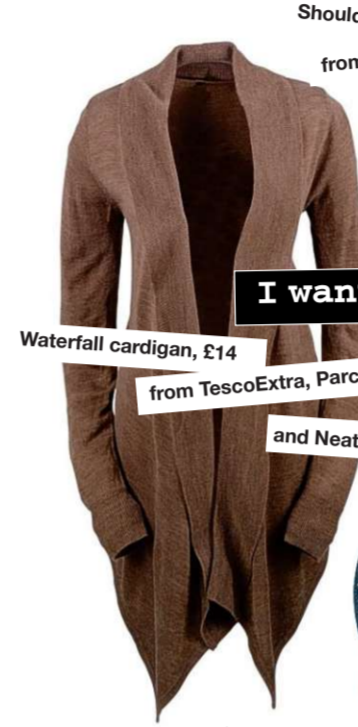
Waterfall cardigan, £14 from TescoExtra, Parc Fforestfach and Neath.