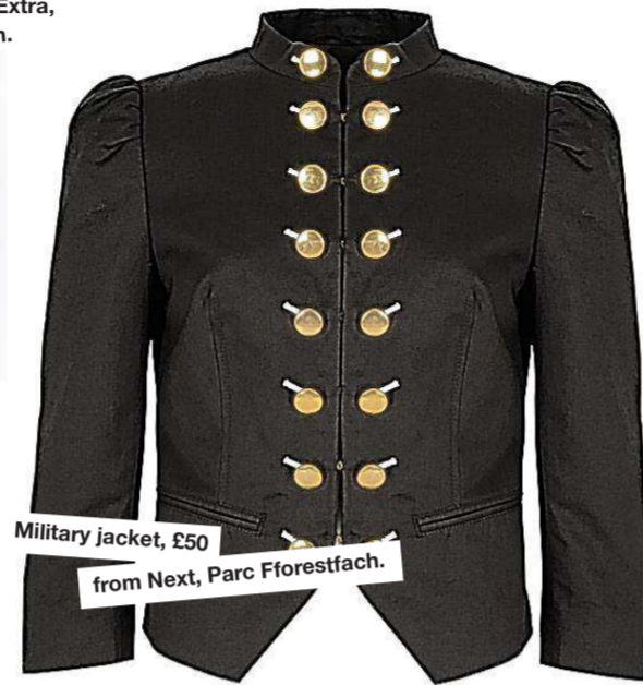
Military jacket, £50 from Next, Parc Fforestfach.