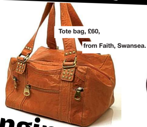
Tote bag, £60, from Faith, Swansea.