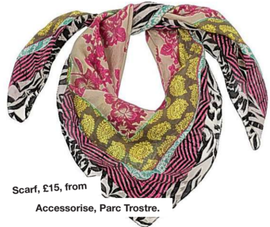
Scarf, £15, from Accessorise, Parc Trostre.