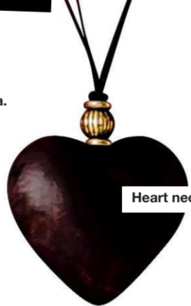
Heart necklace, £5, from QS, Port Talbot.