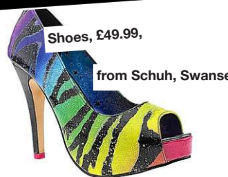
Shoes, £49.99, from Schuh, Swansea.