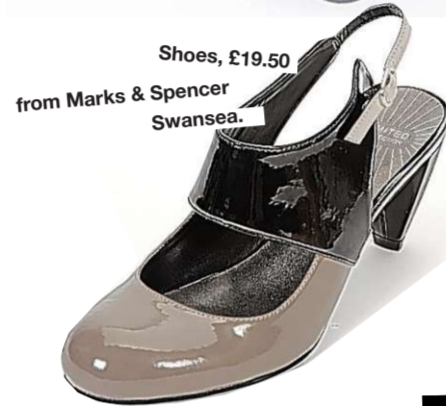
Shoes, £19.50 from Marks & Spencer Swansea.