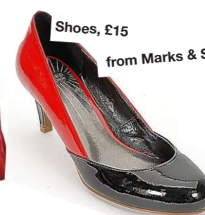
Shoes, £15 from Marks & Spencer, Swansea.