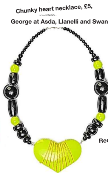
Chunky heart necklace, £5, George at Asda, Llanelli and Swansea.