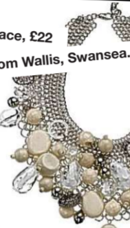
Bib necklace, £22 from Wallis, Swansea.