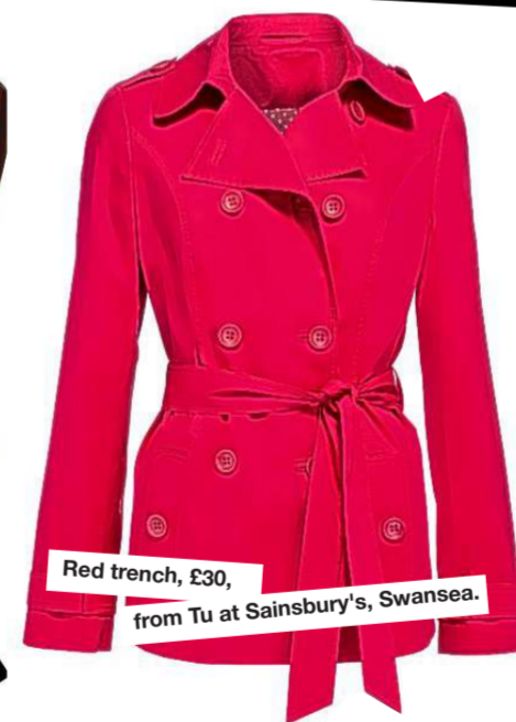
Red trench, £30, from Tu at Sainsbury's, Swansea.