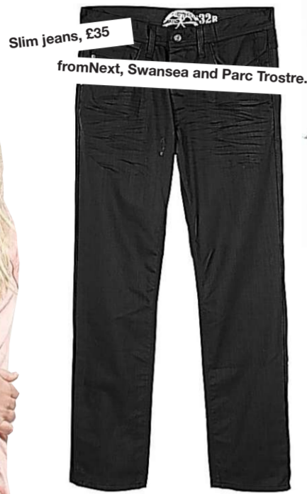
Slim jeans, £35 from Next, Swansea and Parc Trostre.