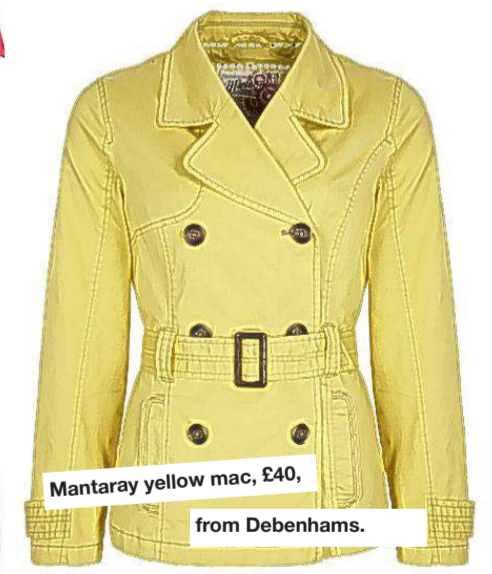
Mantary yellow mac, £40, from Debenhams.

I love black and wear it a lot but realise I need a bit of colour, too