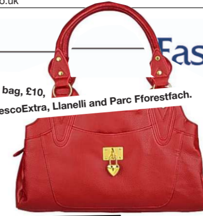
Shoulder bag, £10, from TescoExtra, Llanelli and Parc Fforestfach.