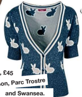
Rabbit card, £45 from Monsoon, Parc Trostre and Swansea.

I want to update my image without looking too young