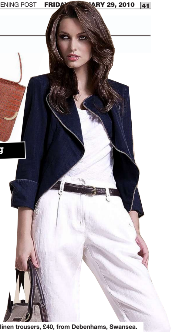
Jacket, £40, top, £45, linen trousers, £40, from Debenhams, Swansea.