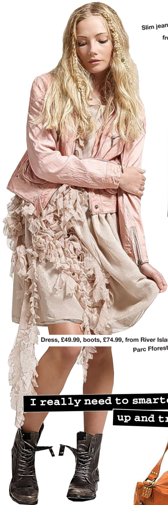
Dress, £49.99, boots, £74.99, from River Island, Parc Fforestfach