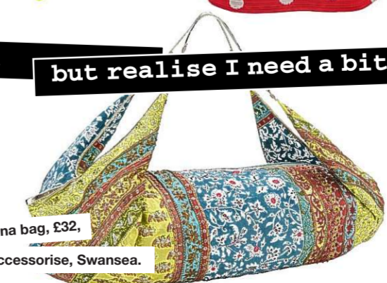
Banana bag, £32, from Accessorise, Swansea.