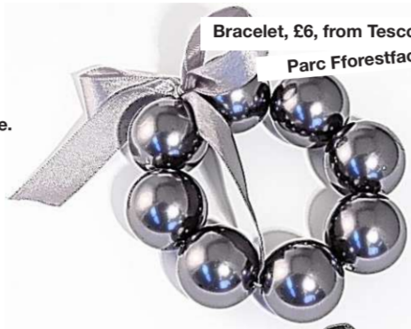
Bracelet, £6, from TescoExtra, Parc Fforestfach.