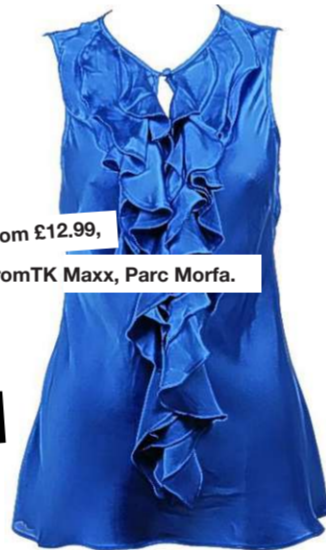
Top, from £12.99, from TK Maxx, Parc Morfa.

I really need to smarten up and try something a bit different from jeans