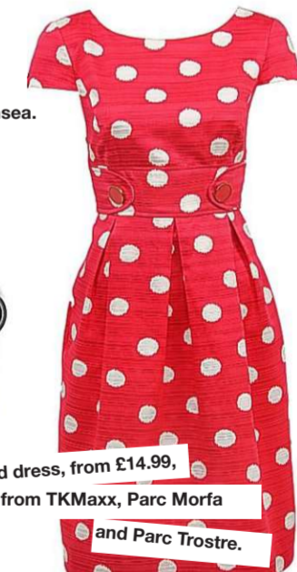
Red dress, from £14.99, from TKMaxx, Parc Morfa and Parc Trostre.