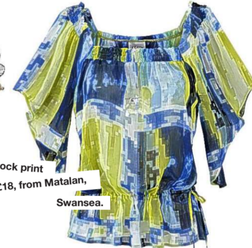
Citrus block print blouse, £18, from Matalan, Swansea.