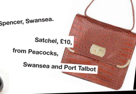
Satchel, £10, from Peacocks, Swansea and Port Talbot

I want to update my image without looking too young