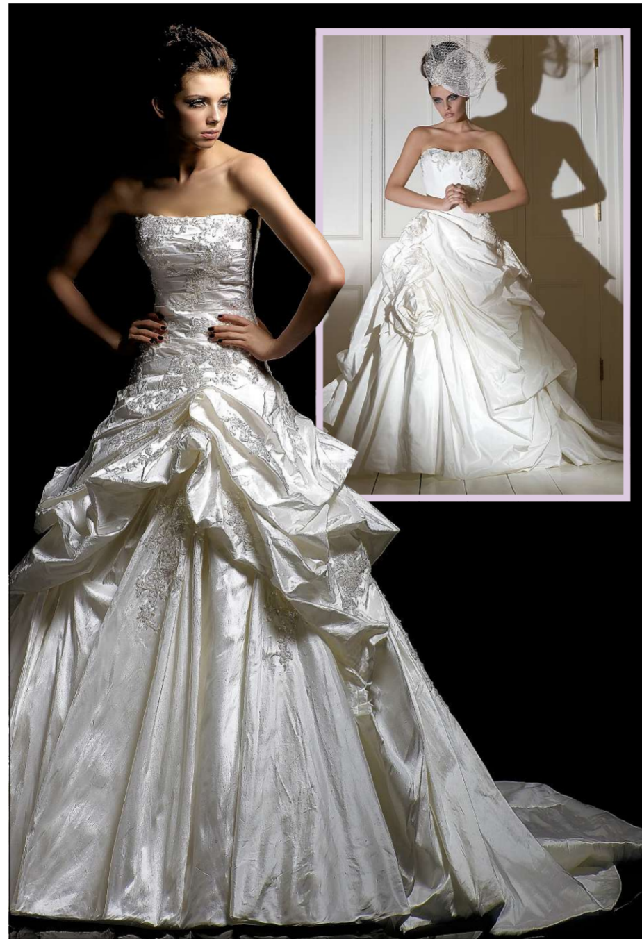
PRINCESS CHIC The Bolgrade wedding dress (above) and (inset) the Couture Heaven dress, both available from Huw Rees bridal boutique, Rhosmaen Street, Llandeilo.