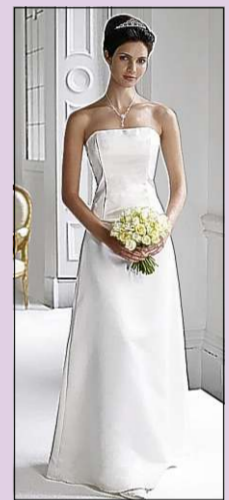
HOURGLASS: Go for strapless or off-the-shoulder dresses to accentuate curves without overloading them.

Avoid heavy beading or large accessories — one-piece dresses with a ripped-in waist are much more flattering. A two-piece can tend to give you a choppy look, whereas you should try to create a seamless effect.