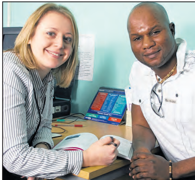
ADVICE: A Staffordshire Connexions adviser chats with a client.

The advisers are qualified and friendly and will talk to you to find out about your skills and interests, enabling you to decide what to do next. They will be covering topics such as: choosing a career, job searching, writing CVs, filling in application forms, interview skills. You can even bring your CV along and have it checked over by the experts. They can also give help and information about finding suitable courses or training, updating skills and finding childcare and funding. Filling out application forms or knowing how to make the